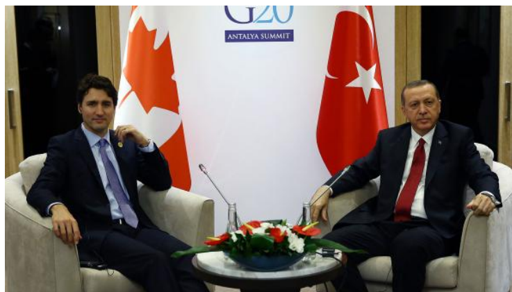
Erdoğan speaks with Trudeau after Canada extends arms sales ban