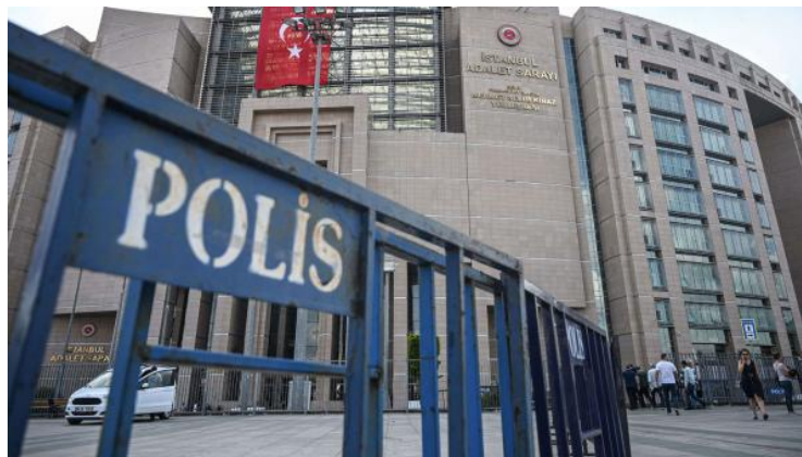
Turkish terrorism investigation names 15 Canadian suspects